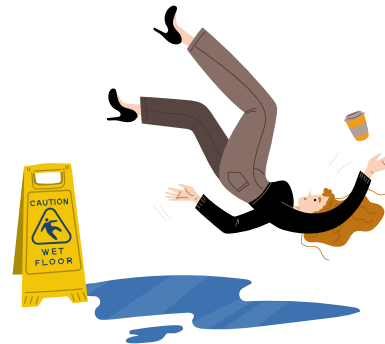
Sliding off a slippery surface