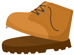
Soles wearing out